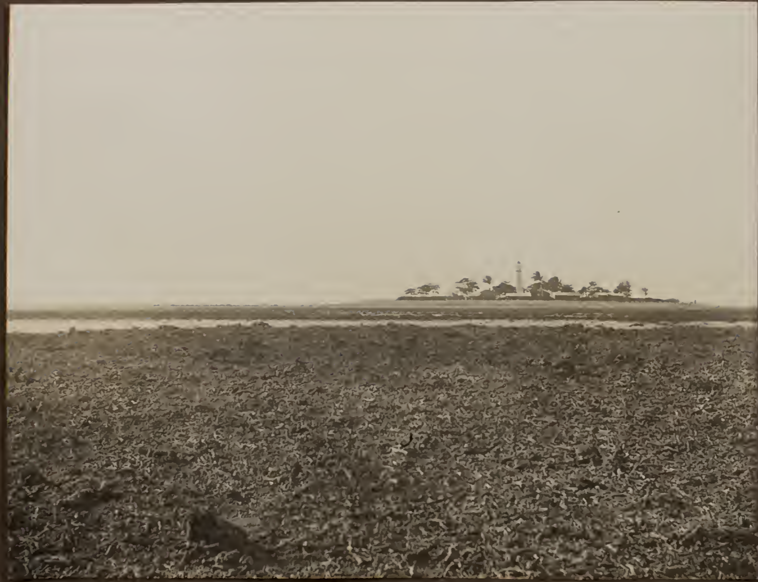
Zone of dead coral fragments.